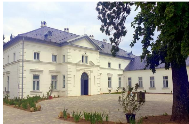
BÖLCSKE, Saint Andras chateau

SoL Hungary and Global SoL invites you to participate in Systemic dialogues for transformative action